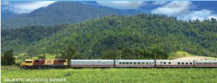
MAJESTIC MOUNTAIN RANGES