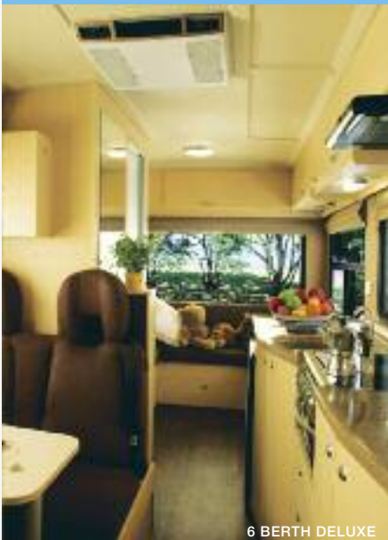
6 BERTH DELUXE

KEA's supremely comfortable 2, 4 and 6 berth campervans, motorhomes and 4WDs are the perfect way to enjoy Australia's unique and beautiful environment, friendly people and relaxed lifestyle.