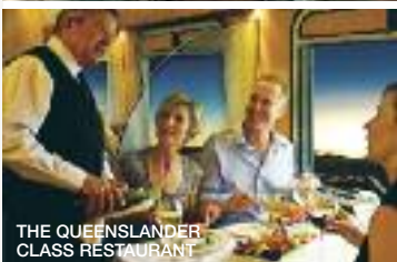
THE QUEENSLANDER CLASS RESTAURANT

The Sunlander is one of Australia's most endearing rail journeys, weaving its way along Australia's incredible north-eastern coastline three times a week. It's a relaxing journey that runs between Queensland's tropical capital, Brisbane, and laid back Cairns. The Sunlander offers plenty of accommodation choices. For the budget conscious, choose from single, twin or triple berth sleeping compartments or seats.