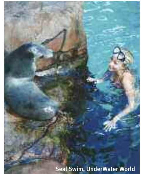
Seal Swim, UnderWater World