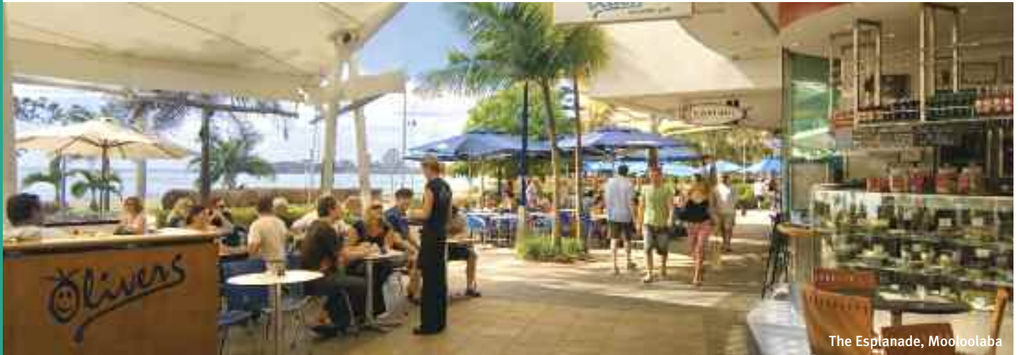
The Esplanade, Mooloolaba

Everything you associate with a beach holiday is here at Mooloolaba. From the marina you can eat fresh prawns direct from the trawlers. You can swim safely on the north-facing beach, play a game of beach cricket, and relax with a picnic on the foreshore and watch the boats sail by. Hire a dinghy or charter a yacht – Mooloolaba has it all.