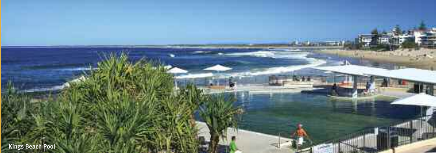
Kings Beach Pool

Framed by breezy beaches, Caloundra is a bustling town that has retained its laid back charm to become a popular holiday spot. Friendly locals and nine beaches set the tone for a great escape.