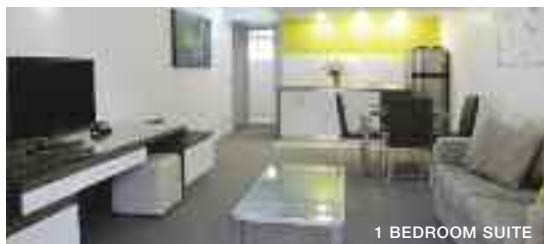
1 BEDROOM SUITE