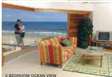
3 BEDROOM OCEAN VIEW