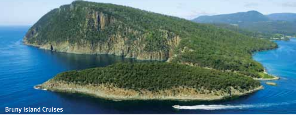
Bruny Island Cruises