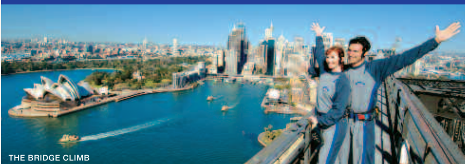
THE BRIDGE CLIMB

There are three unique ways to experience the city of Sydney and the iconic Sydney Harbour Bridge with BridgeClimb Sydney.