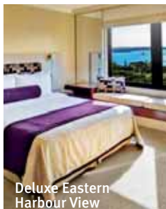
Deluxe Eastern Harbour View