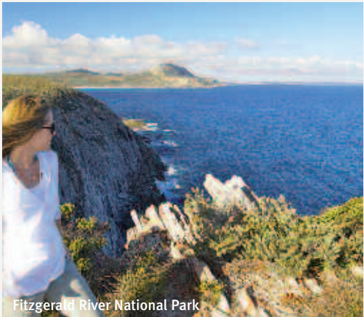
Fitzgerald River National Park