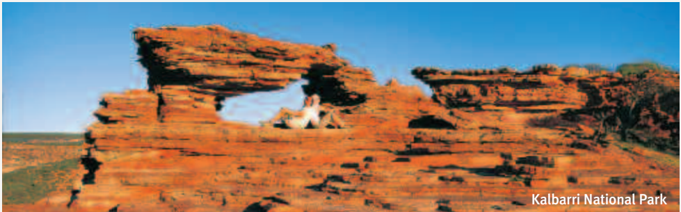
Kalbarri National Park

Friendly locals, incredible wildlife encounters and amazing natural attractions. See it all in Western Australia's Perth and The West Coast region.