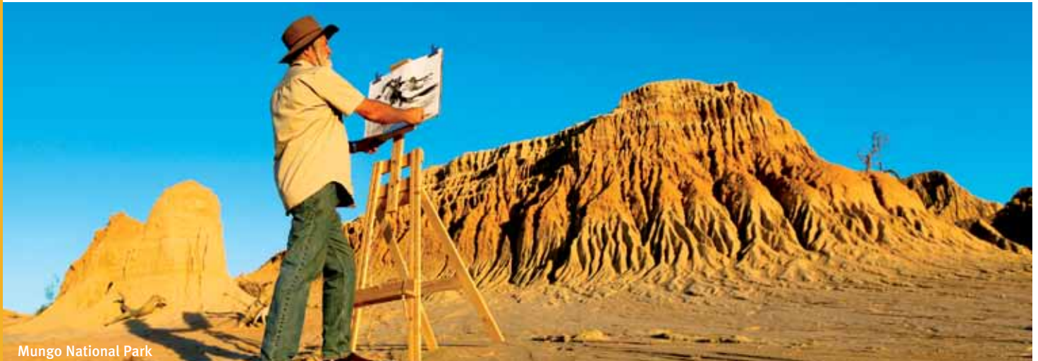
Mungo National Park

Take a journey to country New South Wales to discover spectacular landscapes, classic outback towns and Aussie country hospitality.