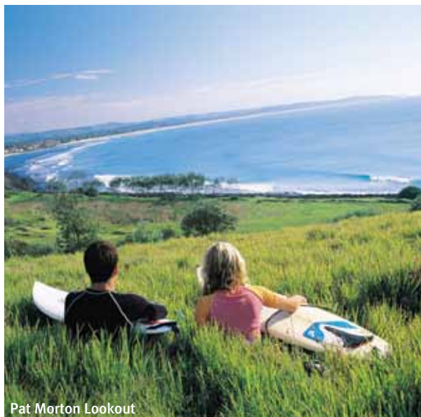
Pat Morton Lookout