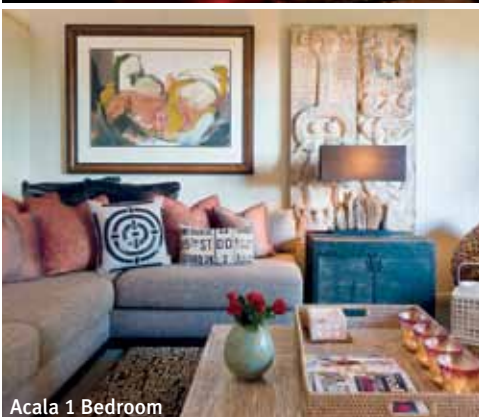
Acala 1 Bedroom