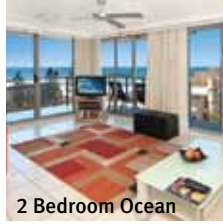
2 Bedroom Ocean

Located across the road from a patrolled beach and within an easy walk to the cafés and restaurants of Tedder Avenue.