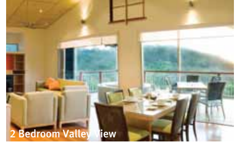
2 Bedroom Valley View