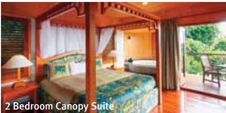
2 Bedroom Canopy Suite