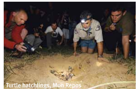
Turtle hatchlings, Mon Repos