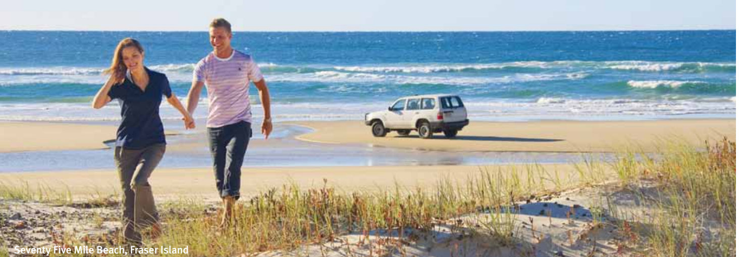
Seventy Five Mile Beach, Fraser Island

Fraser Island is one of those places people keep talking about long after they've left. It's probably the beauty of Seventy Five Mile Beach, the pristine sand-based rainforests, crystal clear lakes and creeks, and the world-class fishing. And then there's that World Heritage Listing that rubber-stamps all this glorious natural beauty.