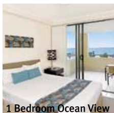
1 Bedroom Ocean View

Shearwater Resort is a modern stylishly appointed resort with six floors of studio, one and two bedroom self-contained apartments.