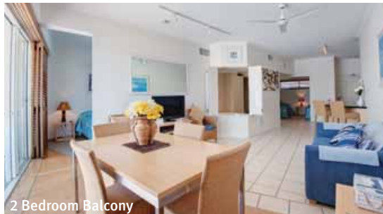
2 Bedroom Balcony

10 Levuka Avenue, Kings Beach, Caloundra